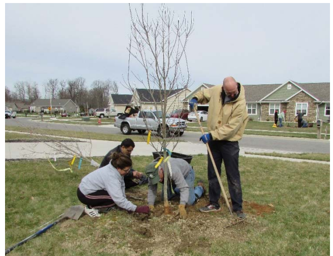
Pictured: White Birch Residents-NeighborWoods