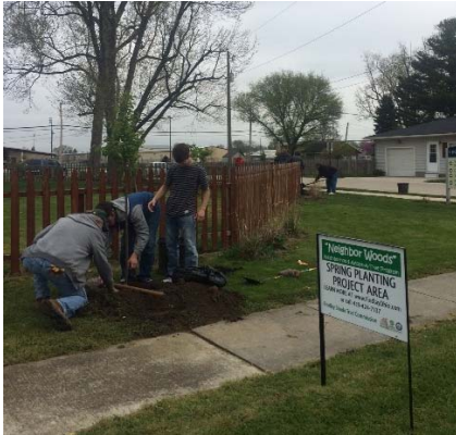
Volunteers planting Howard St. NeighborWoods trees

Thanks to all of you for your continuing support to make Findlay's Tree Program a success. This Annual Report gives an overview of progress in 2016.