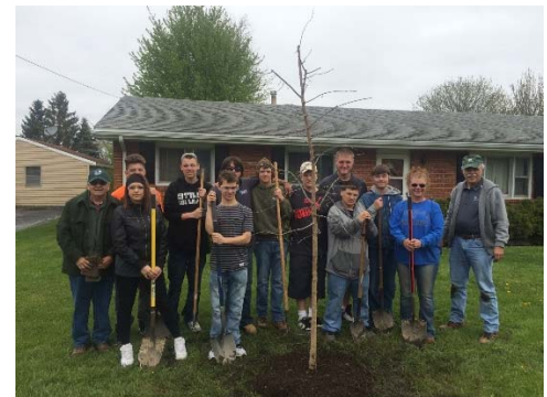
2016 Arbor Day Celebration Millstream Career Center