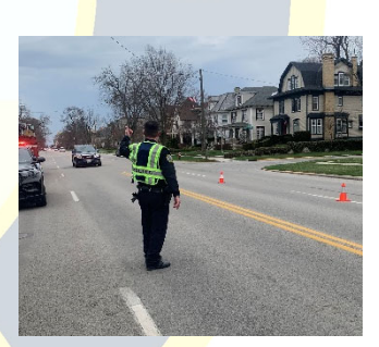
The OVI's, citations, and crash reports were broken down as follows:

Traffic enforcement continues to be an emphasis for the Patrol Division, with the overall goal of reducing traffic accidents and increasing motorist safety. The number of property crashes and injury crashes decreased, however the FPD handled two fatalities during 2023. The number of OVI's decreased, along with a decrease in the number of citations written. There were also 12 motor vehicle pursuits in 2023, compared to 16 in 2022.