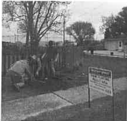
Volunteers planting Howard St. NeighborWoods trees

Thanks to all of you for your continuing support to make Findlay's Tree Program a success. This Annual Report gives an overview of progress in 2016.