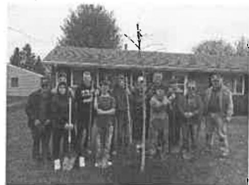
2016 Arbor Day Celebration Millstream Career Center